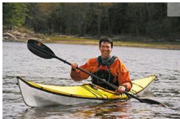
Calgary-based Trak Kayaks' origami-style kayak can go from the closet to the trunk to the water with ease

Accommodating one's love of outdoor adventuring in the cramped quarters of a condo or apartment often requires stretching the rules of home décor. Mountain bikes cling to living room walls like art pieces. Camping equipment acts as home cookware and bedding for unexpected guests.