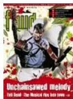
Volume 14 No. 24 May 21, 2009